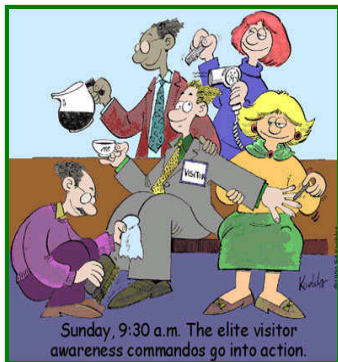
Sunday, 9:30 a.m. The elite visitor awareness commandos go into action.