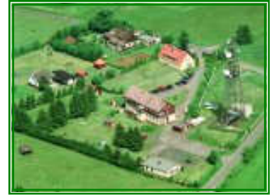
THE KNULL CAMP